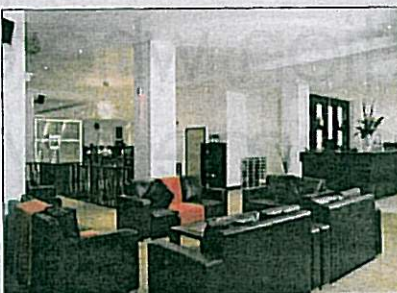
The modern reception and dining areas in The Vedas restaurant